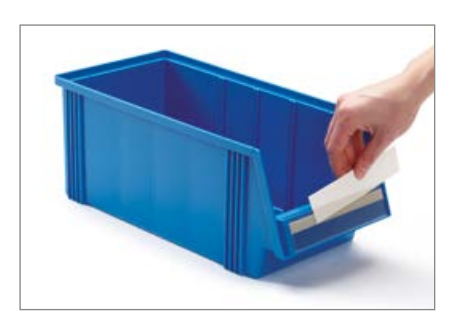
A label with a self-adhesive protective shield is affixed to the front plate of the bin. Such labels are easy to change when necessary. Labels must be ordered separately.