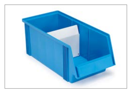
Individual bins can be sub-divided internally using dividers. Steel dividers are powder-coated in a grey finish (RAL 7035). Dividers are ordered separately.