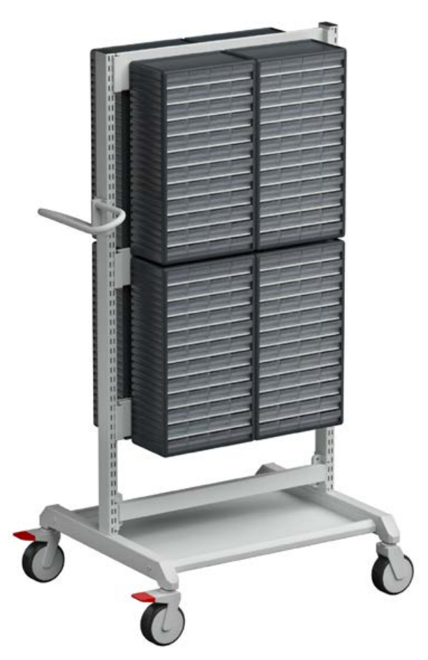
1 x trolley BT-550B 8 x small-parts storage cabinets 550-3

Trolleys are ideal for retail, manufacturing and warehousing providing an efficient storage system for small components. It is easily moved to wherever it is needed. You can build a number of combinations of trolleys to match your needs.