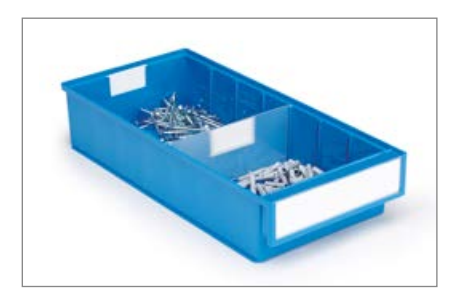
Space is reserved for labels on the rear surface of drawers and on dividers. Labels are ordered separately.