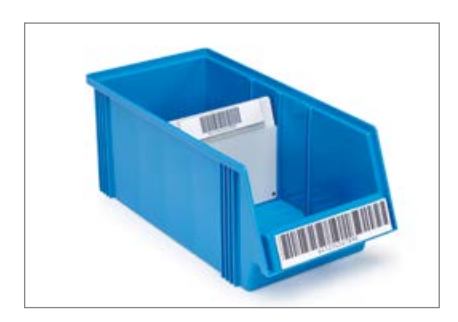
Self-adhesive barcodes can be affixed to the front plate and dividers of a bin.