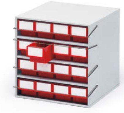
1 x retaining bars A 400 1 x storage bin cabinets 1640-5

Storage bin cabinets are also suitable for use in maintenance vehicles. Retaining bars, to be ordered separately as an accessory, keep the bins in place in a moving vehicle. One set includes 4 pieces. Retaining bars are suitable for models 0830, 1630, 0840 and 1640.