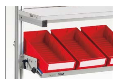
Shelf bins are designed to fit all metric shelving systems.