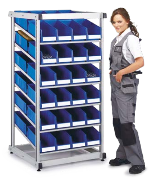
1 x gravity flow rack DBS-808, 48 x stacking bins 1940-6