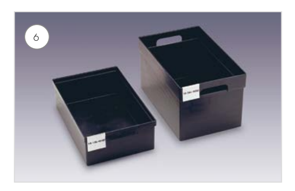
*) Made to order. Request a quotation.