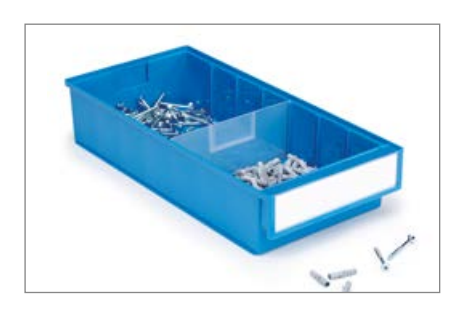
Individual bins can be sub-divided internally using dividers. Dividers are ordered separately.