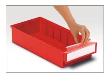
A label with a protective shield is easy to clean and change when necessary. The shield and label is included.