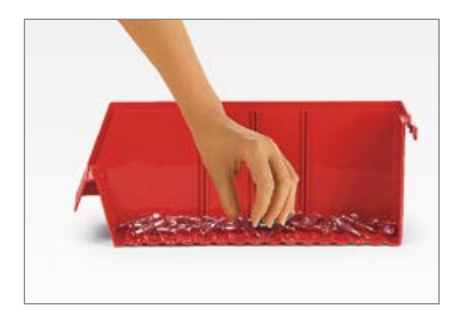
A corrugated base stops items from sliding around on the surface and makes picking them up easier.