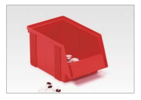
The design, with a half-open front, allows excellent visibility and easy access to the bin's contents, making it easy to pick from.