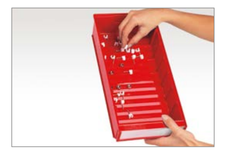
Corrugated base stops items from sliding on the surface and makes picking up small items easy.