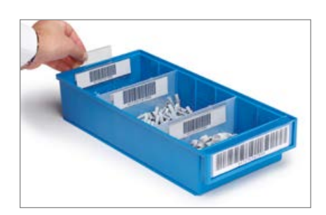
Adhesive barcode labels can be affixed to the smooth sides of the dividers. A blanking piece, FP-6 M, can be installed to create a flat surface on the back of the bin for adhesive barcode labels. Blanking piece is ordered separately.